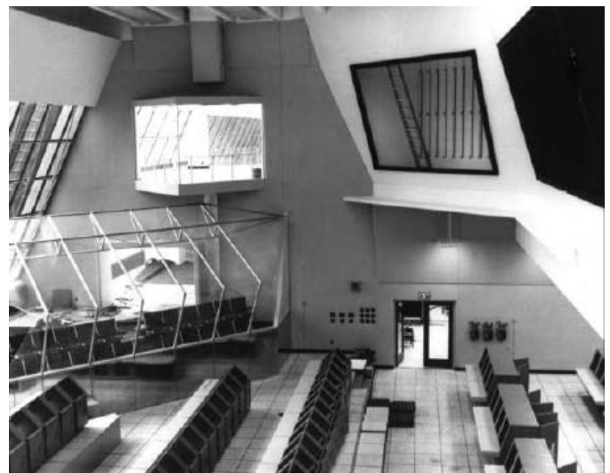
Firing room 1 under construction, August 1965. The VIP viewing area is under the glass wall, at left. The windows on the extreme left looked toward the pads. The triangular extension into the room above the VIP area was for the most distinguished guests.

The O & C building was a multi-storied structure of approximately 56,430 square feet (17,200 square meters), containing as much flexibility as the Apollo spacecraft that