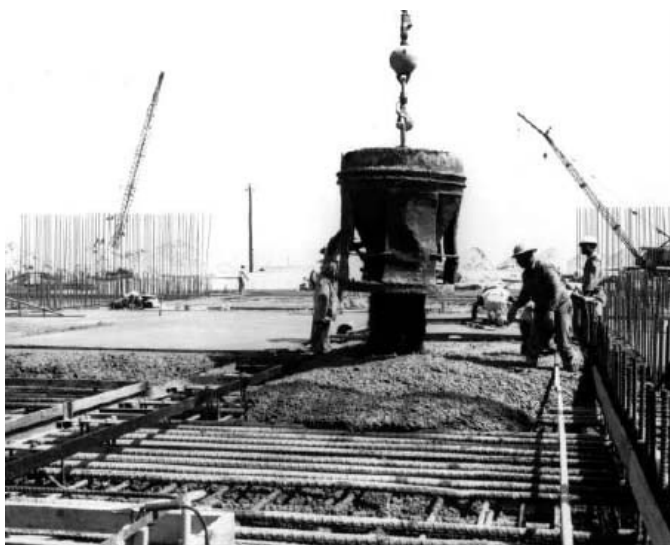
Pouring the concrete floor for the VAB.

Another critical part of the construction was the addition of three cranes. A 175-ton crane with a hook height of about 50 meters would run the length of the building and would traverse both the low bay and high bay areas above the transfer aisle. Two other cranes, with a 250-ton capacity and hook height of approximately 140 meters, would be capable of movement from an assembly bay on the opposite side. Although bridge cranes of this capacity are not unusual in heavy industry, there were unique requirements for precision, smoothness and control of their vertical and horizontal movement. The cranes would cost about $2 million.