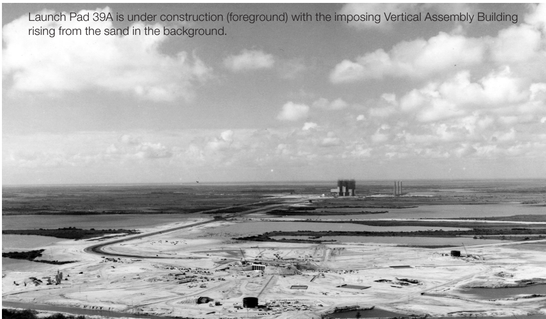
Launch Pad 39A is under construction (foreground) with the imposing Vertical Assembly Building rising from the sand in the background.