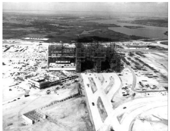
The VAB rises in steel to dominate the landscape. On the left is the lower Launch Control Center. In the foreground are the crawlerway and roads.

With steel column sections and other structural steel arriving at the job site, erection of the framework began in