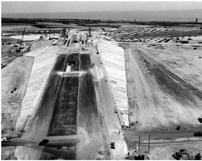
The flame trench bisects the launch pad.

An emergency egress system was part of the pad A contract. If a hazardous condition were to arise that allowed safe egress from the spacecraft, the astronauts could cross over to the mobile launcher on a swing arm. They would then ride one of the high-speed elevators to level A, slide down an escape tube to a thickly padded rubber deceleration ramp, and enter -- through steel doors -- a blast room, which could withstand an on-the-pad explosion of the entire space vehicle.