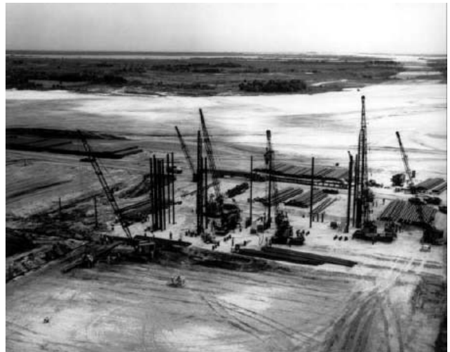
Driving the pilings for the VAB.

At the peak of activity, 10 pile drivers were in action. Three of them were new, electrically driven, vibratory drivers. When the piles reached the first thin stratum of limestone at about 36 meters, steam- or diesel-driven pile drivers took over and pounded the piles into the bedrock, which ranged from 151 feet to 171 feet (46 to 52 meters)