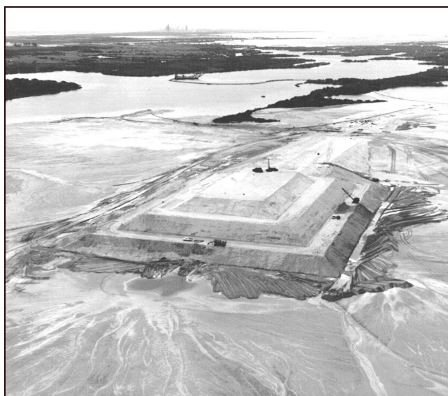
Dredged sand created the 80-foot-high mound that would become launch pad A.

The pumps piled up another portion of the dredged sand on the launch pad, creating a flat-topped pyramid of sand and shell 80 feet (24.4 meters) high. During the process, draglines, bulldozers and other earth-moving equipment molded the mound into the approximate shape of the pad. In a short period of time, the pyramid settled 3.9 feet (1.2 meters), compressing the soil beneath. Bulldozers