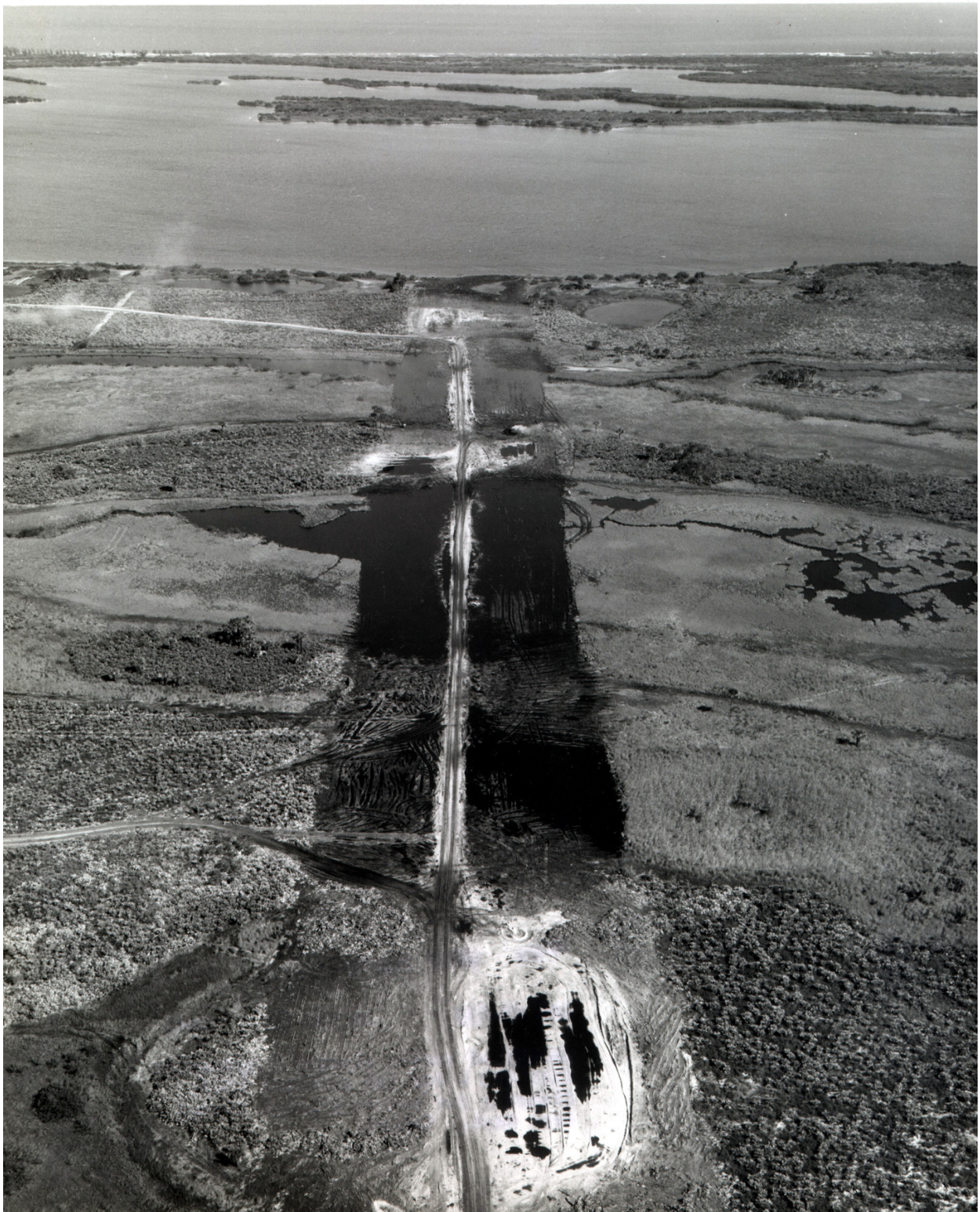
Aerial of the VAB site (foreground) and road to pad 39C (later pad A) during dredging of access channel, Jan. 23, 1963.