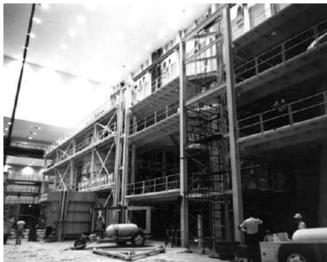
Interior of the Operations and Checkout building, August 1965. The two partly visible silos at left are altitude chambers.

The central instrumentation facility centralized the handling of NASA data and provided housing for general instrumentation activities that served more than one complex. The Launch Operations Center coordinated the